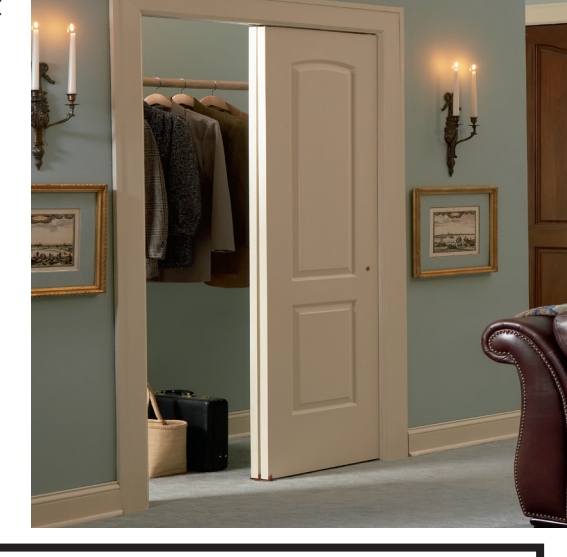
Complete Hardware Set 100SD Track(2 pieces per set)

See online at: www.johnsonhardware.com/100SD.htm